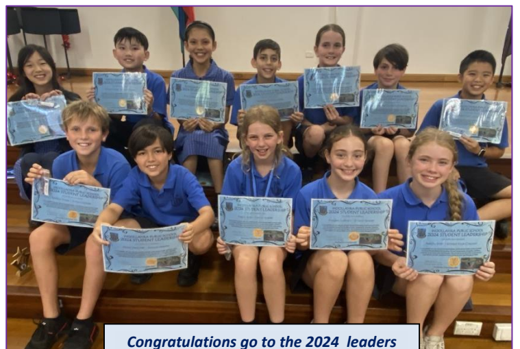
Congratulations go to the 2024 leaders